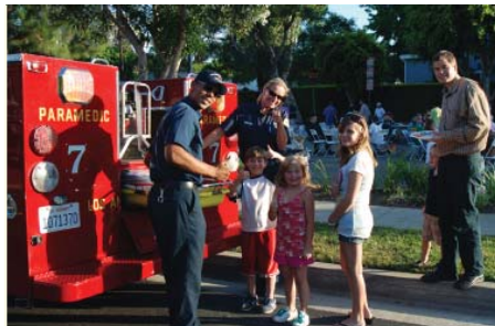
Firefighters from WeHo #7 get thumbs up from future WeHo leaders!